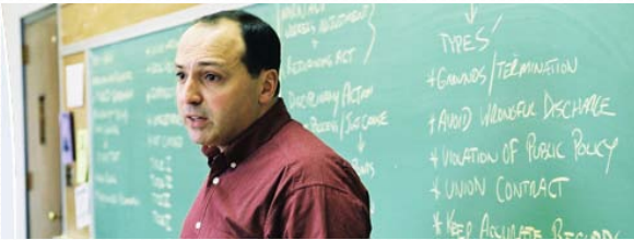
Professors vs. Teaching Assistants