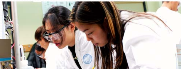
Can the student enter as undecided?