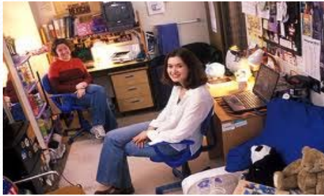
Dorming vs. Commuting